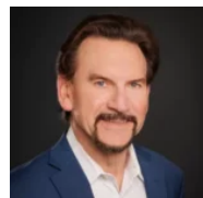
Frank Adashun Jones, Inc.

3-bedroom, 1-bath, 1.5 story home on the southeast side town! Featuring 1260 sq. ft. Vinyl siding and a full basement!This is a Fannie Mae Homepath property.