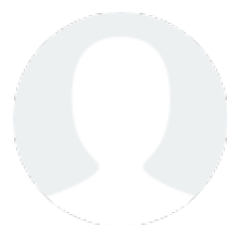
Jim Oskey Realty LLC