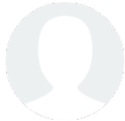
Kent Jason Gerhard & Associates Real Estate