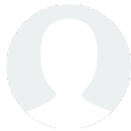
Jessica Design Realty