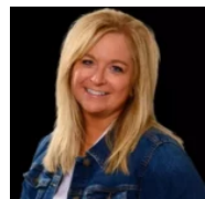
Colette Adashun Jones, Inc.