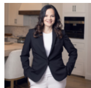
Sarah Adashun Jones, Inc.