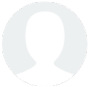
Kent Jason Gerhard & Associates Real Estate