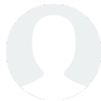
Kevin Real Broker LLC