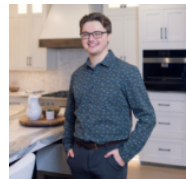
Glenn Adashun Jones, Inc.