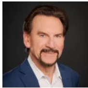
Frank Adashun Jones, Inc.

FANTASTIC OPPORTUNITIES AWAIT YOU WITH THIS 2 BEDROOM PROPERTY FEATURING A VACANT LOT TO THE SOUTH OF THE DWELLING THAT CAN BE PURCHASED FOR $49,900 HOUSE IS BEING SOLD AS IS FOND DU LAC RIVER