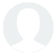
Andrew Best Built, Inc.