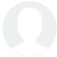
Jami Trimberger Realty, LLC