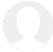
Andrew Best Built, Inc.