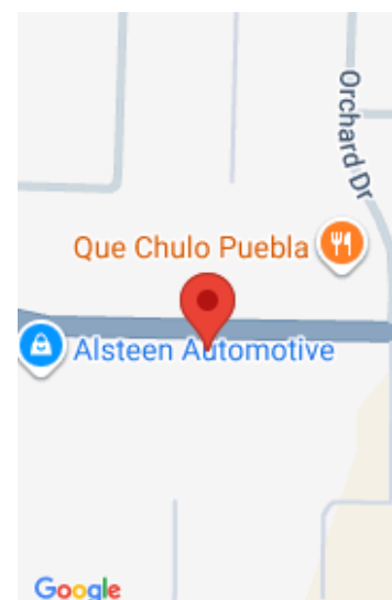
Coldwell Banker Real Estate Group