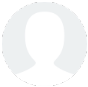
Kent Jason Gerhard & Associates Real Estate