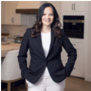
Sarah Adashun Jones, Inc.