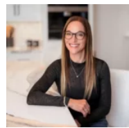
Jodi Adashun Jones, Inc.