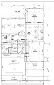
340 Twilight Trail INTERIOR DETAILS