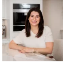
Summer Adashun Jones, Inc.