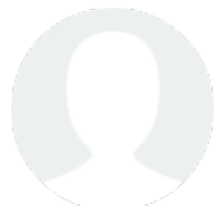
Tyson Adashun Jones, Inc.