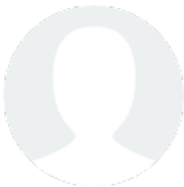
Tanner Beckman Properties