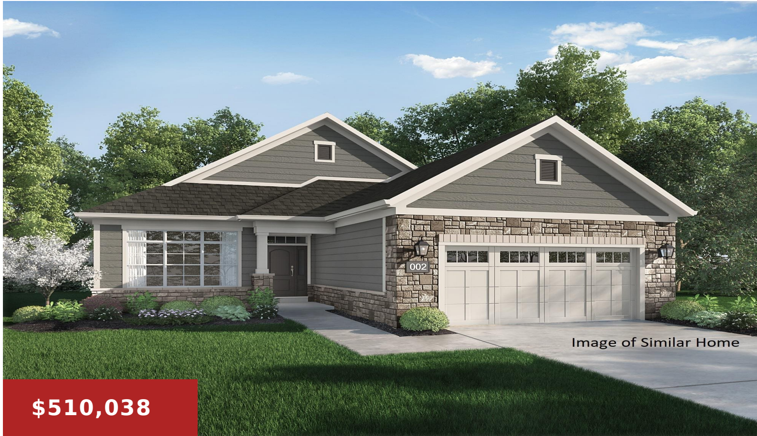
Image of Similar Home

3384 EVENING STAR Drive, GREEN BAY, WI, 54311-7308