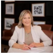
Jan Adashun Jones, Inc.