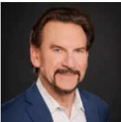
Frank Adashun Jones, Inc.

GOOD PLACE TO START! 3 BDRM, WITH NICE EAT-IN KITCHEN AND COZY LIVING ROOM. LOW MAINTENANCE EXTERIOR AND 1.5 CAR GARAGE. PLEASE CONTACT OFFICE FOR MORE INFO.