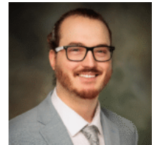
Nathan Adashun Jones, Inc.