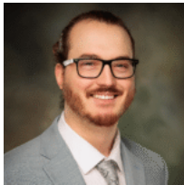
Nathan Adashun Jones, Inc.