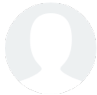
Brian Hietpas Realty