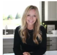
Kelly Adashun Jones, Inc.

Lots of living space is the 2 bedroom, 1 bath home. Spacious living and family rooms ! Nice kitchen with dining area! Lot's of potential in this awesome home! Just needs to find the right owner! Also includes a great detached two car garage. Close to waterpark! Steal of a deal!