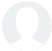
Kent Jason Gerhard & Associates Real Estate