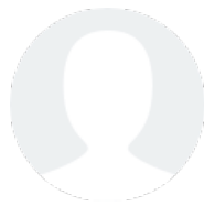
Ryan Kos Realty Group