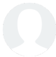
Brittney Kos Realty Group