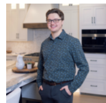
Glenn Adashun Jones, Inc.