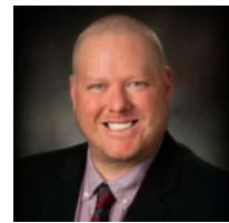
Chris Adashun Jones, Inc.