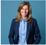
Gail Adashun Jones, Inc.