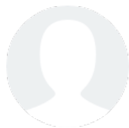
Arlene NEW Realty LLC