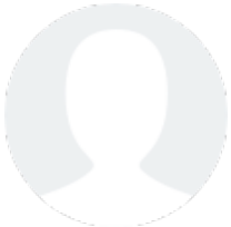
Aaron Curran Real Estate, LLC