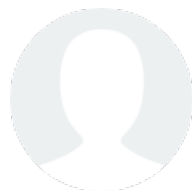
Ryan Corbett Realty