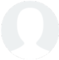
Andrew Best Built, Inc.