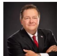
Jay Adashun Jones, Inc.