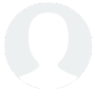
Jennifer McMahon Realty Group