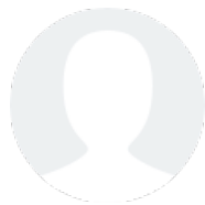
Holli McMahon Realty Group