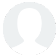
Jordan Beiser Realty, LLC