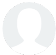
Amy Adashun Jones, Inc.