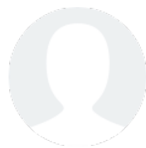
Gerry O'Connor Realty Group