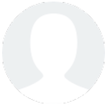
Mari OK Realty