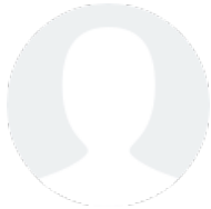
Chris Dallaire Realty