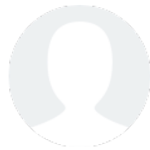
Andrew Best Built, Inc.