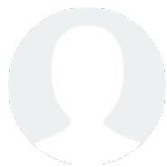
David Roberts Homes and Real Estate