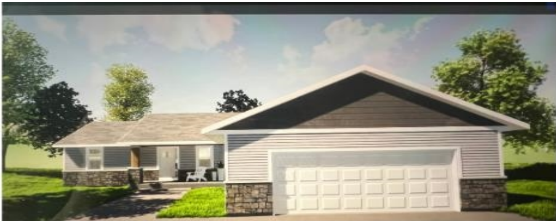
Rendering of home. To include a 3 car garage.