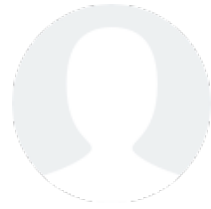
Andrew Best Built, Inc.