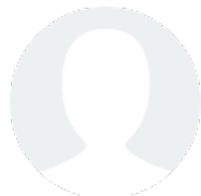
Jabriel Adashun Jones, Inc.