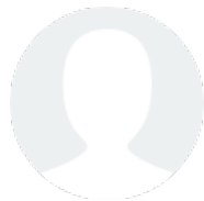
Jabriel Adashun Jones, Inc.