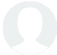
Robin First Weber, Inc.